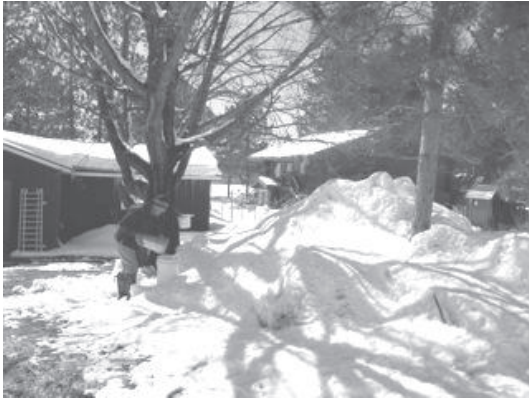
Trying to collect maple sap this spring!

Deer Lake Watershed Association PO Box 23 Effie, MN 56639